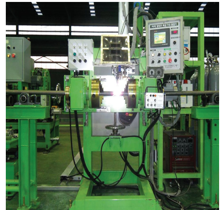
Tube auto butt welding machine