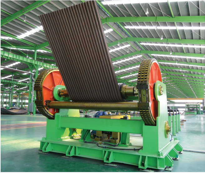
Membrane panel bending machine