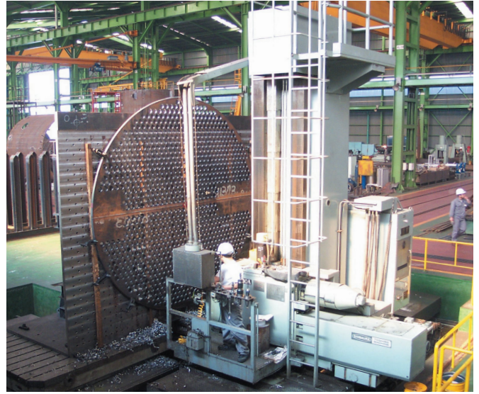
CNC horizontal boring machine