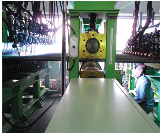
Membrane panel welding machine