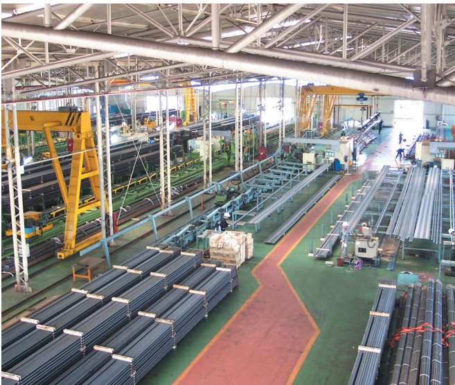
Spiral fin tube welding machine