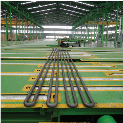
Loop coil bending machine